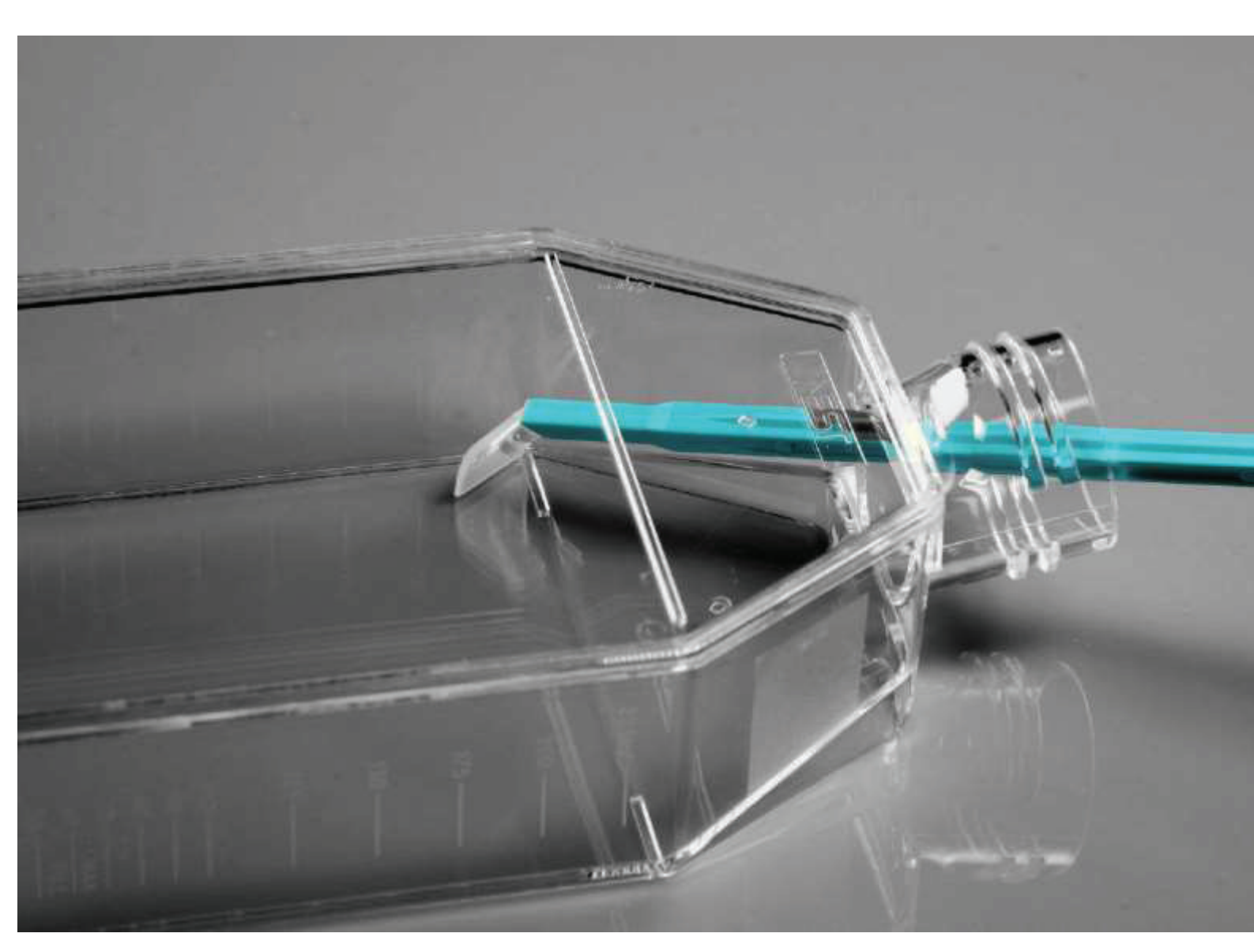
Cell Culture Products